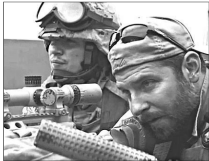
Bradley Cooper stars in the much talked about motion picture 'American Sniper.'

1333 N. Santa Fe Ave. #102 • 330.9156 Mon-Fri 11a-9p • Sat 11a-8p • Sun Closed